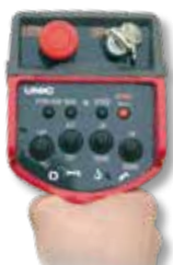
Radio remote control